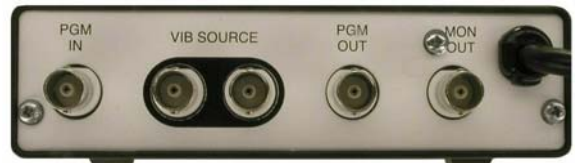
IEC-787 REAR PANEL

2137 Rust Avenue Cape Girardeau, MO 63703 Phone: 573 334 4433 FAX: 573 334 9255